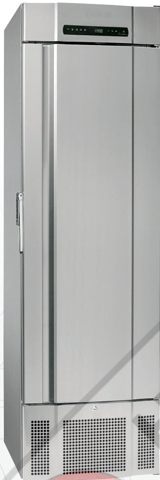
BioMidi EF425. Drawers are optional extras.