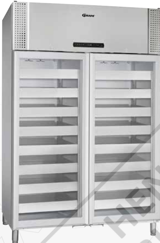
BioPlus 1400. Drawers and glass doors are optional extras.

The BioPlus 1270/1400 range is designed for the storage of the most delicate biomaterials, in situations where even tiny fluctuations in conditions inside the storage cabinet can have a serious effect on the contents.