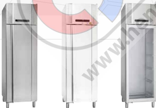
BioPlus 500. Drawers and glass door are optional extras.

In terms of performance, these units are designed to provide the very best results even under exceptional conditions. The BioPlus utilises environmentally responsible HFC-free foam propellants and is available with HFC-free refrigerants.