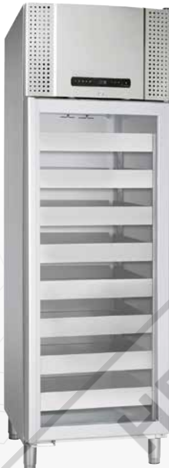
BioPlus 660D. Drawers and glass door are optional extras.