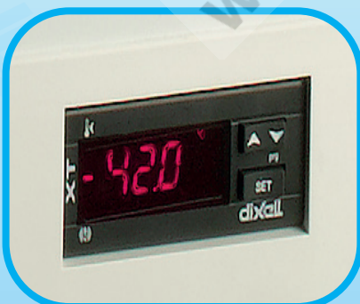
Digital Temperature Display

Bespoke racking can be provided if required as can baskets at an extra cost. To increase the life of your freezer and to ensure you get optimum performance, preventative maintenance contracts are also available. Why not ask for details when you order?