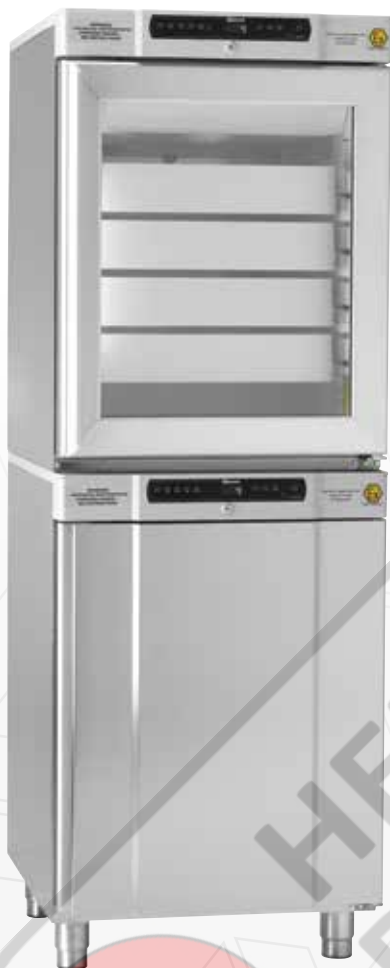
BioCompact II RR210 / RF210 Drawers and glass door are optional extras.