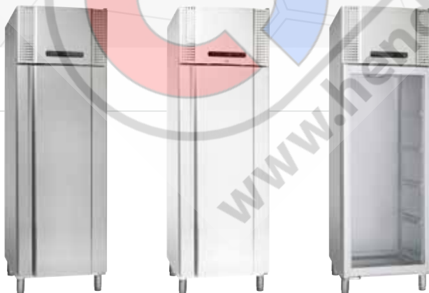
BioPlus 660D. Drawers and glass door are optional extras.

In terms of performance, these units are designed to provide the very best results even under exceptional conditions. The BioPlus utilises environmentally responsible HFC-free foam propellants and is available with HFC-free refrigerants.