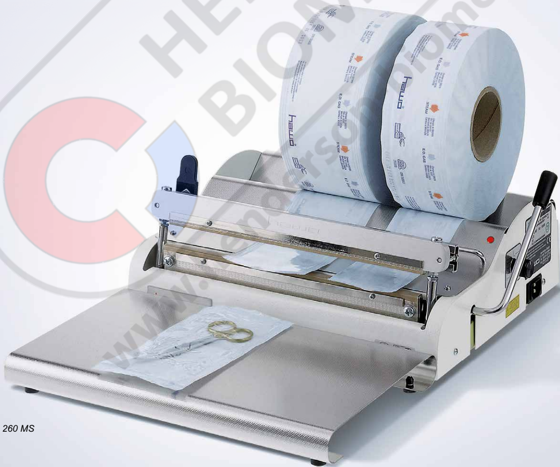
hd 260 MS

The impulse sealers hd 260 MS, hd 270 MS and hd 470 MS are our most economical bar sealers for the packaging of sealable pouches and reels as well as thermo-plastic film. Thanks to the adjustable sealing timer the devices can be easily adapted to the material. They are ideally suited for use in smaller institutions and tattoo studios.