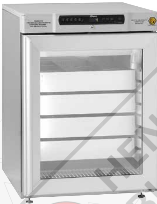
BioCompact II RR210. Drawers, reference container and glass door are optional extras.

Available in either white or stainless steel finish, with a one-piece moulded ABS inner lining. Shelves and drawers are mounted in U-shaped rails moulded into the plastic walls.