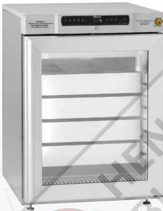
BioCompact II RR210. Drawers, reference container and glass door are optional extras.

Available in either white or stainless steel finish, with a one-piece moulded ABS inner lining. Shelves and drawers are mounted in U-shaped rails moulded into the plastic walls.