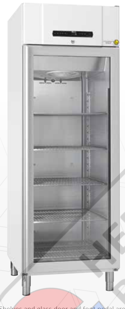
Shelves and glass door and foot pedal are optional extras.

The BioCompact II 610 is a range of economical, environmentally responsible refrigerators and freezers designed specifically for biostorage uses.