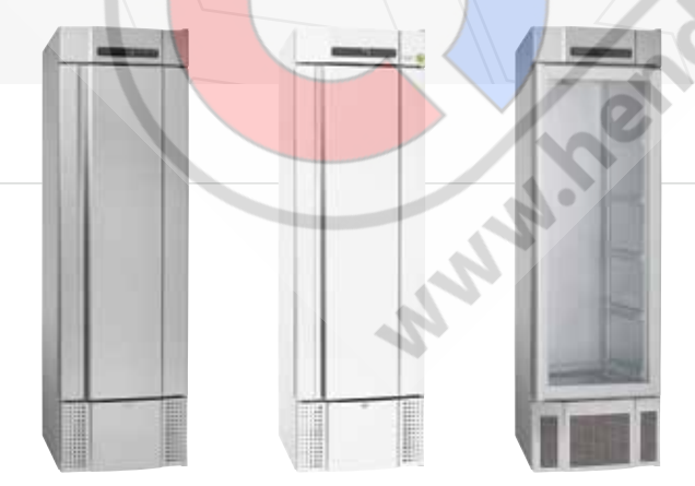
The BioMidi 425 is available as a refrigerator or freezer in either white, aluminium or stainless steel finish. All BioMidi models come with selfclosing door. Glassdoor is available for refrigerator.

The functional design ensures easy, ergonomically correct access to the storage space.