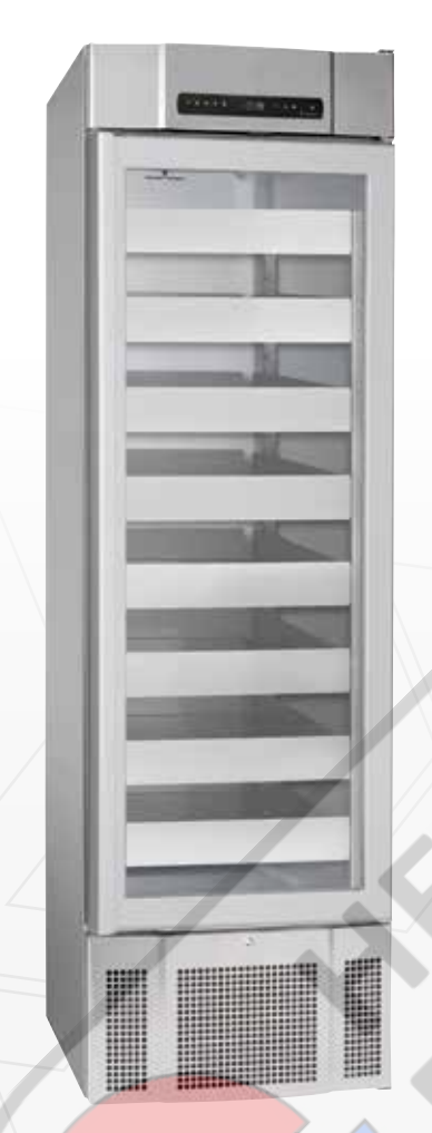
BioMidi 425. Drawers and glass door are optional extras.

The BioMidi 425 cabinet is designed to meet your biomaterial refrigeration and freezer requirements, with very few limitations.