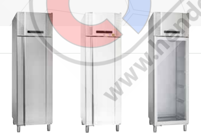
BioPlus 500. Drawers and glass door are optional extras.

The BioPlus 500 is available as a refrigerator or freezer in either white or stainless steel finish. All BioPlus models come with self-closing door. Glass door is available for refrigerator.